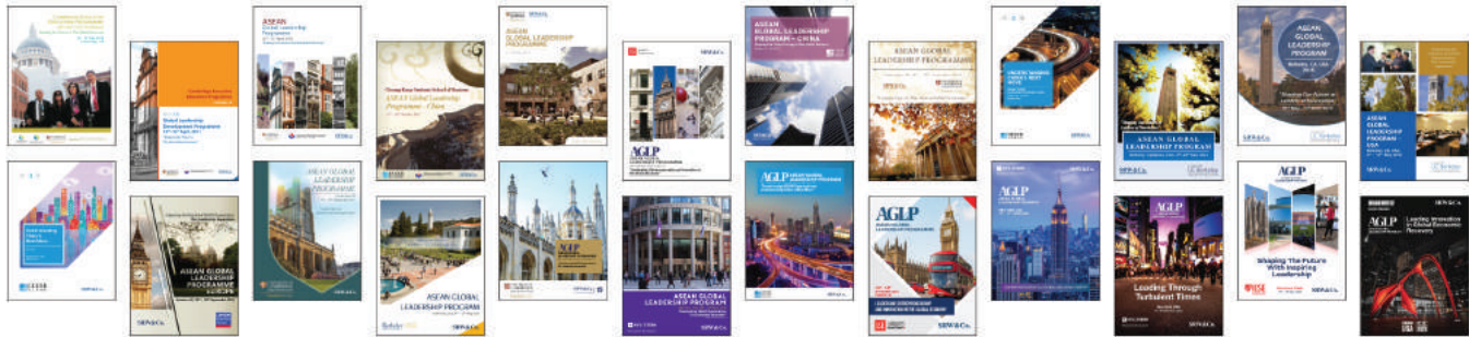
AGLP Editions 2009 - 2023

The ASEAN Global Leadership Program is a custom designed 5-day programme focusing on the 4 key themes of Globalisation, Entrepreneurship, Innovation, and Leadership.